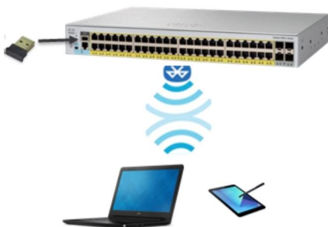
Figure 4. Over-the-air switch access using Bluetooth