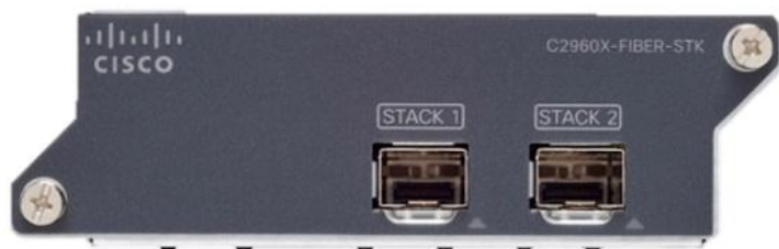
Figure 7. Cisco FlexStack-Extended: Fiber module