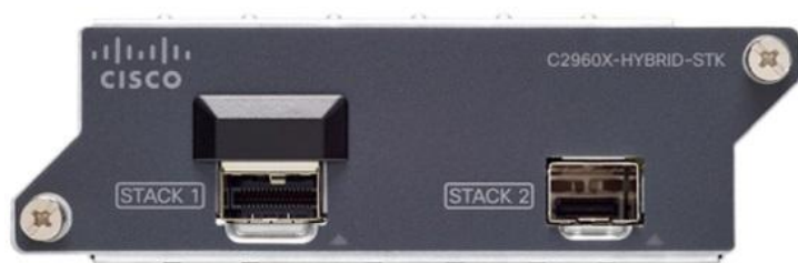
Figure 6. Cisco FlexStack-Extended: Hybrid module