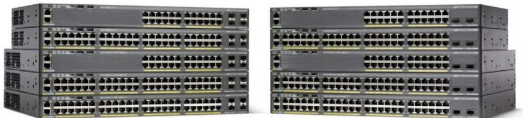
Figure 1. Cisco Catalyst 2960-X Series Switches

Cisco® Catalyst® 2960-X and 2960-XR Series Switches are fixed-configuration, stackable Gigabit Ethernet switches that provide enterprise-class access for campus and branch applications (Figure 1). They operate on Cisco IOS® Software and support simple device management as well as network management. The Cisco Catalyst 2960-X and 2960-XR Series provide easy device onboarding, configuration, monitoring, and troubleshooting. These fully managed switches can provide advanced Layer 2 and Layer 3 features as well as optional Power over Ethernet Plus (PoE+) power. Designed for operational simplicity to lower total cost of ownership, they enable scalable, secure, and energy-efficient business operations with intelligent services. The switches deliver enhanced application visibility, network reliability, and network resiliency.