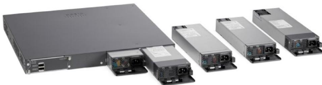
Figure 2. Cisco Catalyst 2960-XR Series power supply

Dual redundant power supplies are supported on the Cisco Catalyst 2960-XR Series Switches. These switches ship with one power supply by default. The second power supply can be purchased at the time of ordering the switch or as a spare. These power supplies have built-in fans to provide cooling (Figure 2).