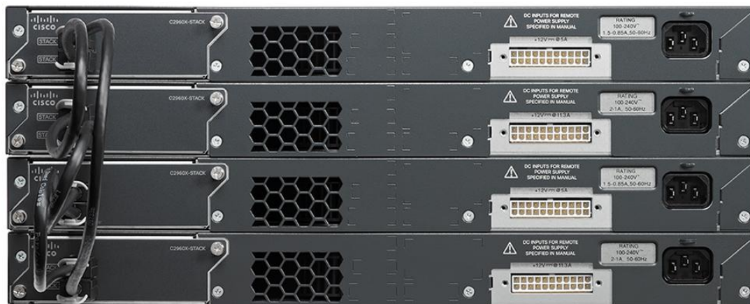
Figure 5. Cisco FlexStack-Plus switch stack

Cisco FlexStack-Extended enables a long-distance out-of-the wiring-closet stack option (floor to floor). It allows back-panel stacking of up to eight Cisco Catalyst 2960-X or 2960-XR Series Switches. FlexStack-Extended can be added to a Cisco Catalyst 2960-X or 2960-XR Series Switch with a back-panel stacking slot. Table 8 lists the switch combinations supported with FlexStack-Extended, and Table 9 lists the scalability and performance with the various software images. FlexStack-Extended is supported in Cisco IOS 15.2(6)E or later and is available in two module configurations: a fiber module and a hybrid module.